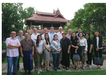
Thai seed seminar. Chiang Mai, 3 July

hub. The Access to Seeds Index was also invited by Syngenta to participate in a seminar during the Responsible Business Forum in Johannesburg (31 August) and to participate in a panel discussion on the Future of Farming, organized by Bayer Cropsience in Monheim (19 September).