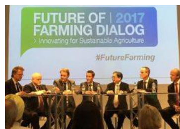
Future of Farming Dialog. Monheim, 19 September