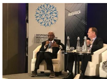
Responsible Business Forum. Johannesburg, 31 August