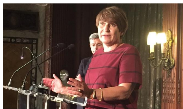
Minister Lilianne Ploumen giving a speech at the launch of the World Benchmarking Alliance, New York, 21 September 2017

The WBA indicates growing international support for industry benchmarking, as it is endorsed by NGOs like Oxfam and WWF and financially supported by the governments of the UK, The Netherlands and Denmark. The founding fathers of the WBA are investor Aviva, the UN Foundation, Index Initiative and the Business & Sustainable Development Commission.