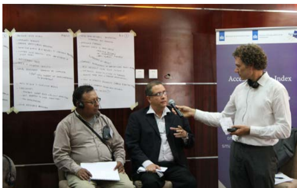
Photo 2 Farmer representatives from Latin America

not very helpful to get local varieties recognized. This requires national laws to adjust standards on a particular country. The question is how can we accommodate our diversity and how can the international community help with that? In Bolivia last year the government brought in improved maize varieties in the Santa Cruz region. They did not produce as promised. It became a complete disaster. Crops failed. It was found out that the seeds were not tested beforehand for the local conditions and climate. What's more, the seeds were maize seed for feed, not for food, although