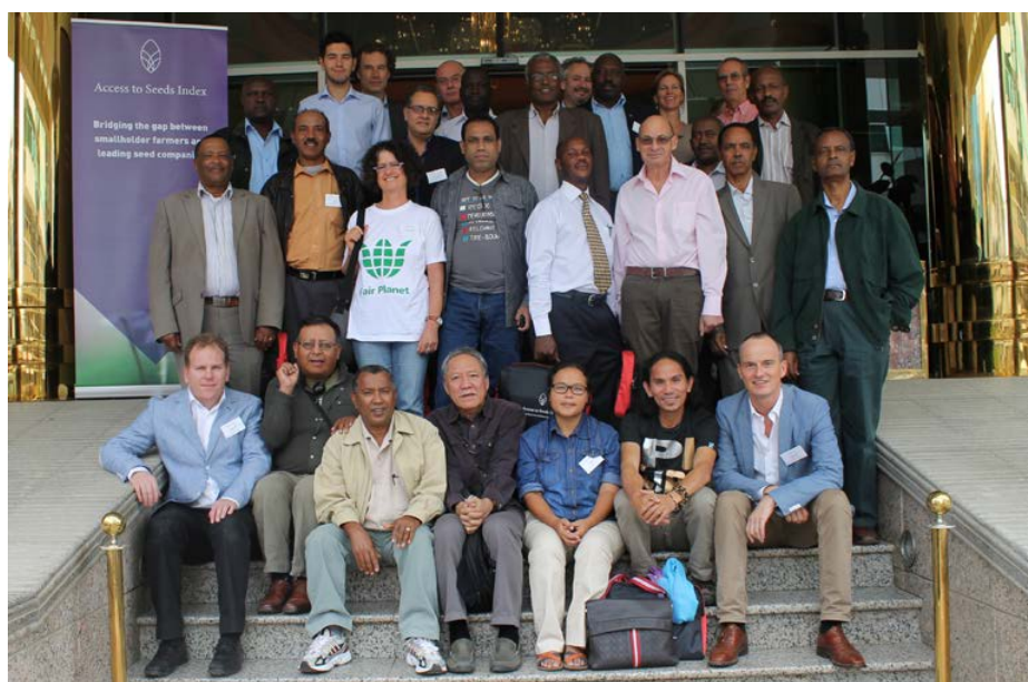
Photo 1 Participants of the Farmers' Round Table in Addis Ababa, 23-24 september 2013

In close cooperation with Agriterra eleven representatives of farmers' organizations from Latin America (2), West Africa (2), East Africa (4) and Asia (3) were invited to participate in the conference. To prepare for this conference they were asked to consult their organisations on the three main questions addressed. Also representatives of four NGO's, two research institutes, four local seed companies and participants with a seed industry background were invited to enrich the dialogue in the conference with insights from their respective backgrounds.