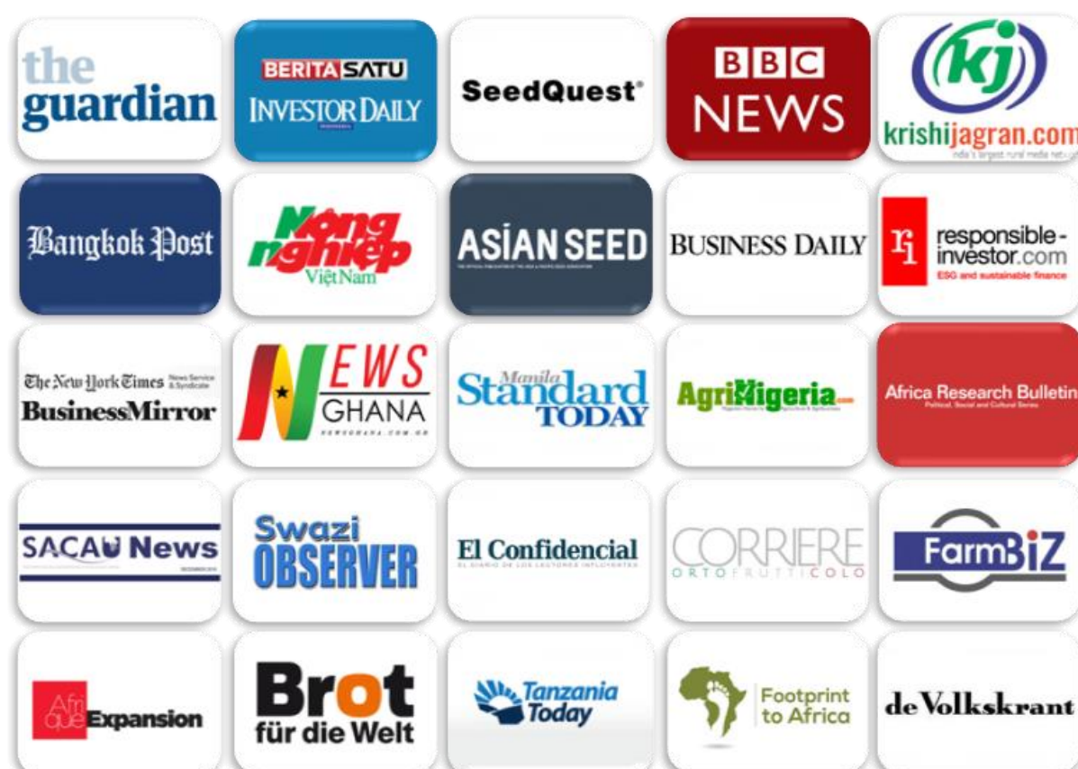
Cross-section of media outlets that covered the Access to Seeds Index in 2016

Companies were informed about their individual scores and relative performance in the Index before publication. They were also offered a follow-up conversation to discuss their results in more detail and provide feedback to the Foundation on the data collection process and methodology. Eight out of the 13 companies in the Global Index accepted that invitation. The Foundation will organize a roundtable in 2017 to discuss the findings with and elicit feedback from the companies featured in the Regional Index for Eastern Africa.