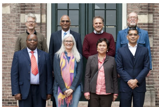
Global ERC, Amsterdam, 9 November, 2017