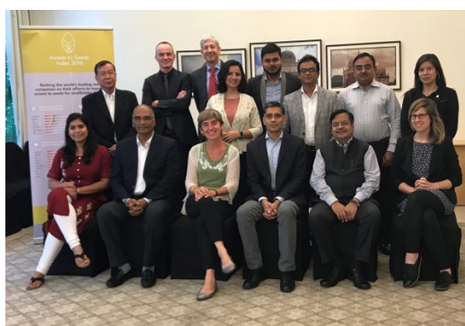
Regional ERC South and Southeast Asia, Hyderabad, 24 October 2017