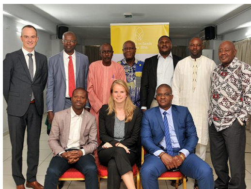
Regional ERC West & Central Africa, Abidjan, 10 October 2017

On 12 October, the Expert Review Committee (ERC) for Eastern and Southern Africa convened in Johannesburg, South Africa, to discuss the proposal to extend the geographical scope of the Regional Index for Eastern Africa towards Southern Africa. A landscaping study clarified that, from a seed industry perspective, these can be regarded as one region. The landscaping study also identified four new companies to include in the regional ranking. The ERC approved all proposals presented by regional consultant Claid Mujaju.