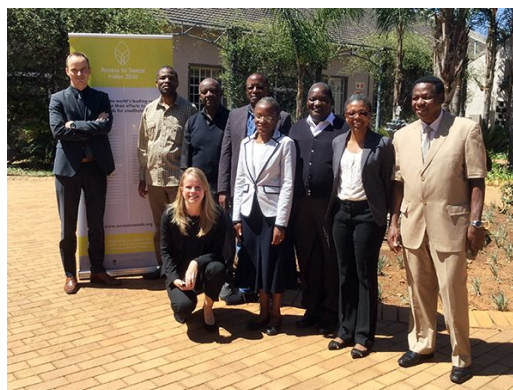
Regional ERC Eastern & Southern Africa, Johannesburg, 12 October 2017